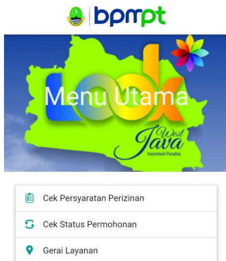
Figure 7 The Display of DPMPTSP West Java Licencing Online in Smartphone

their smartphone. This is one of transparency made by BPMPT West Java. The display BPMPT West Java Licencing online in smartphone can be seen in the following figure: