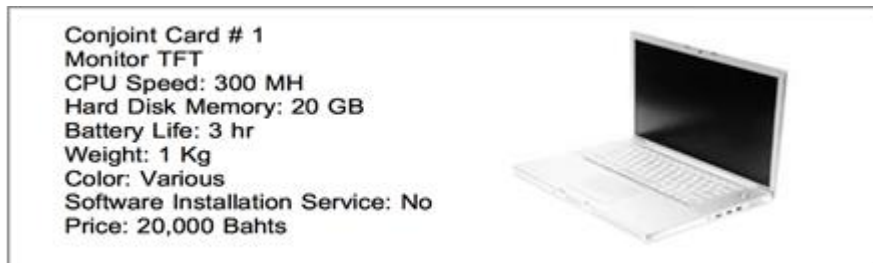
Figure 2 Example of conjoint analysis card (Sabseree, 2009, p.75)

Sabseree (2009, p.71) described that conjoint analysis is a useful technique for consumer study. This term means two or more characteristics are considered together in order to find “Product attribute”. The appearance of the level is called “Element”. Respondents score or rank the mixed elements which can be either a photo, description or sample of products.