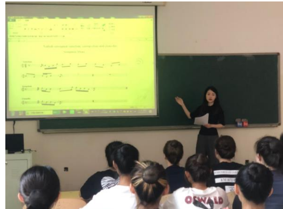
Figure 2 Researcher is teaching and giving test to students of experimental group

4. Teaching 12 lessons to students in experimental group, each lesson last for 45 minutes. Collecting data has done by giving the formative test to students at the end of the class to know an effectiveness of teaching.